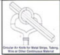
Circular Air Knives for Metal Strips, Tubing, Wire or Other Continuous Material