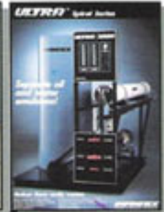
ULTRAFIL Special Series