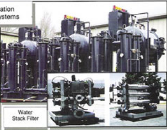
Water Stack Filter