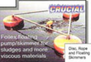
Foilex floating pump/skimmer for sludges and more viscous materials