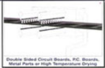
Double Sided Circuit Boards, P.C. Boards, Metal Parts or High Temperature Drying