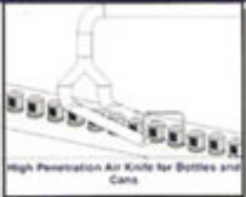
High Penetration Air Knives for Bottles and Cans