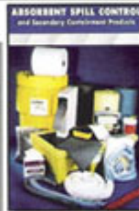
ABSORBENT SPILL CONTROL and Secondary Containment Products

Air Quality (Fume and Mist Removal) Waste Water/Process Water Recovery Coolant Recovery Solvent Recovery Oil Recovery/Reclamation Oil/Water Separators Compressor Condensate Clean-up www.wastewaterfiltration.com